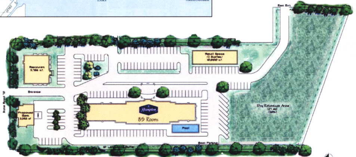
PARK PLACE SITE PLAN